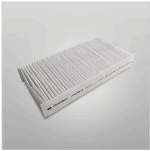
P750019 AIR FILTER, PANEL VENTILATION